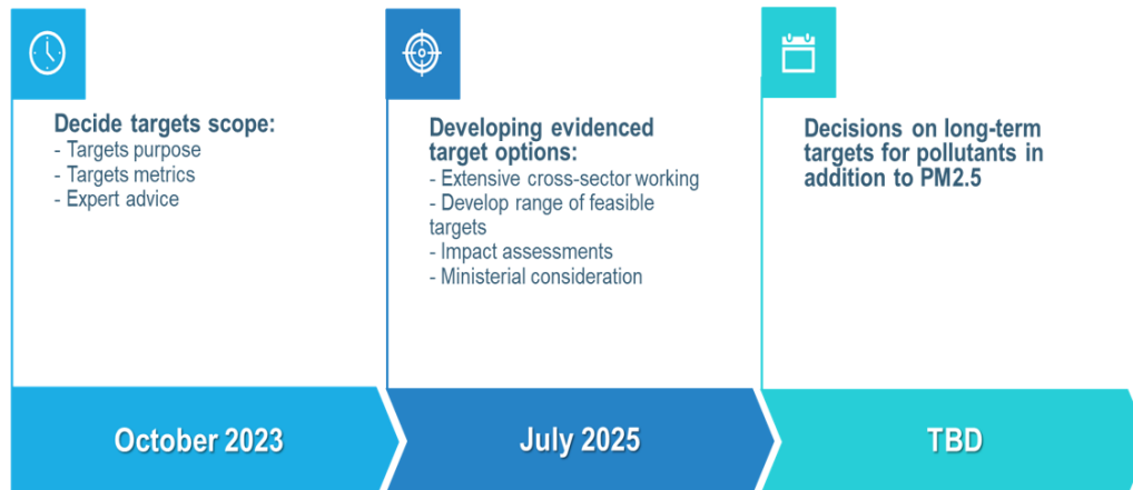
Figure 3: Additional air quality target options development timeline